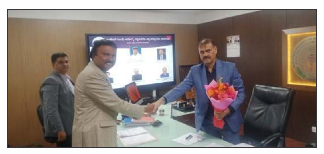
IMA-KSB President Participated Syndicate Meeting, RGUHS