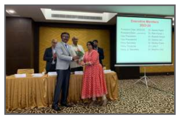
IMA-KSB President Visit to Whitefield Branch