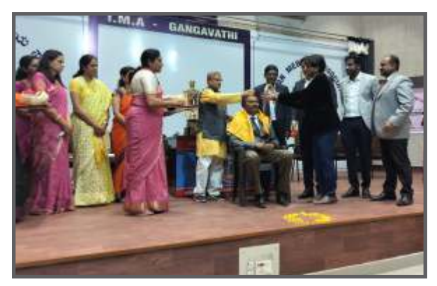
IMA-KSB President Visit to Gangavathi Branch