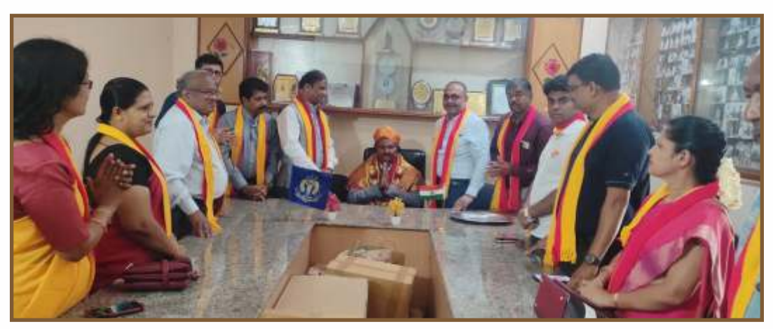
IMA-KSB President & State Secretary Visit to Bangalore Branch