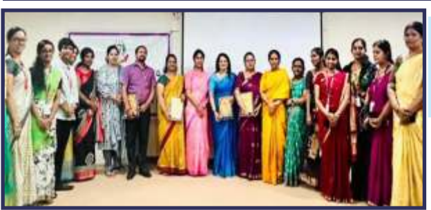
As part of the "Cancer Awareness Week "IMA Chickballapur conducted a Live Colposcopy Workshop" in Sri Sathya Sai Memorial Hospital Muddenahalli on 5th