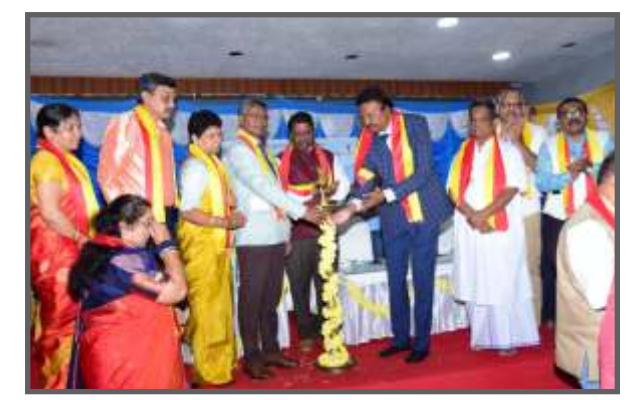
IMA-KSB President Inaugurated Kannada Rajyotsava Celebration at Tumkur